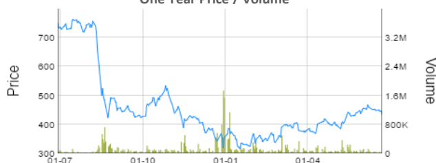
One Year Price / Volume